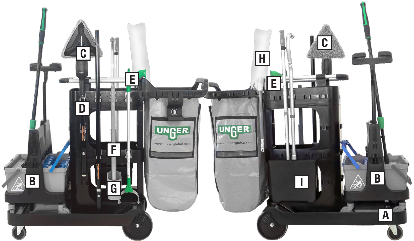
DeepCleanRx Janitorial Cart System PART NO.: CRTDC CASE QTY: 1