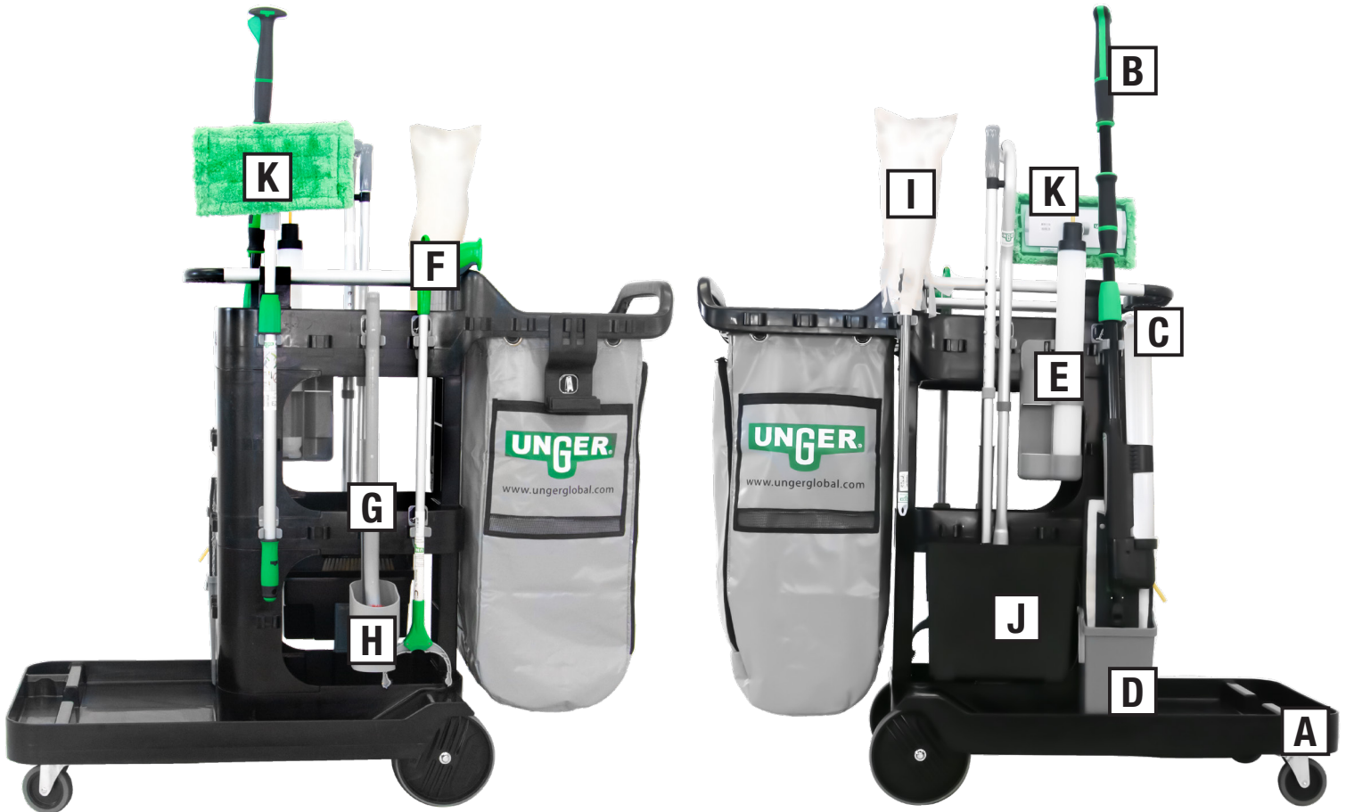
SpotClean Rx Janitorial Cart System PART NO.: CRTSP CASE QTY.: 1